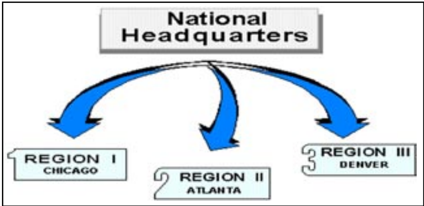
Figure 1 - Agency Structure

The current structure of the Selective Service System also includes three Region Headquarters. The National Headquarters and Region Headquarters make up the contingency of full-time employees of Selective Service. See Figure 1 below.